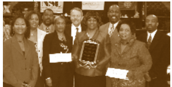
Congratulations to the CCR team!